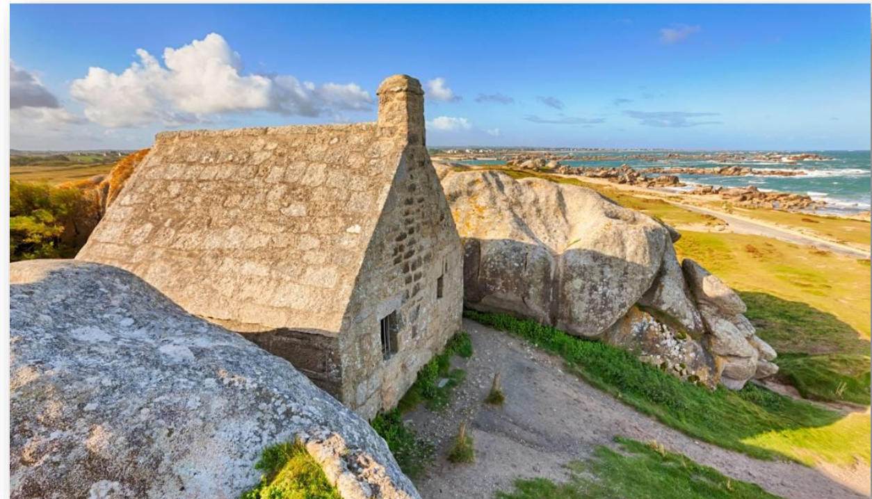
Hamlet of Meneham